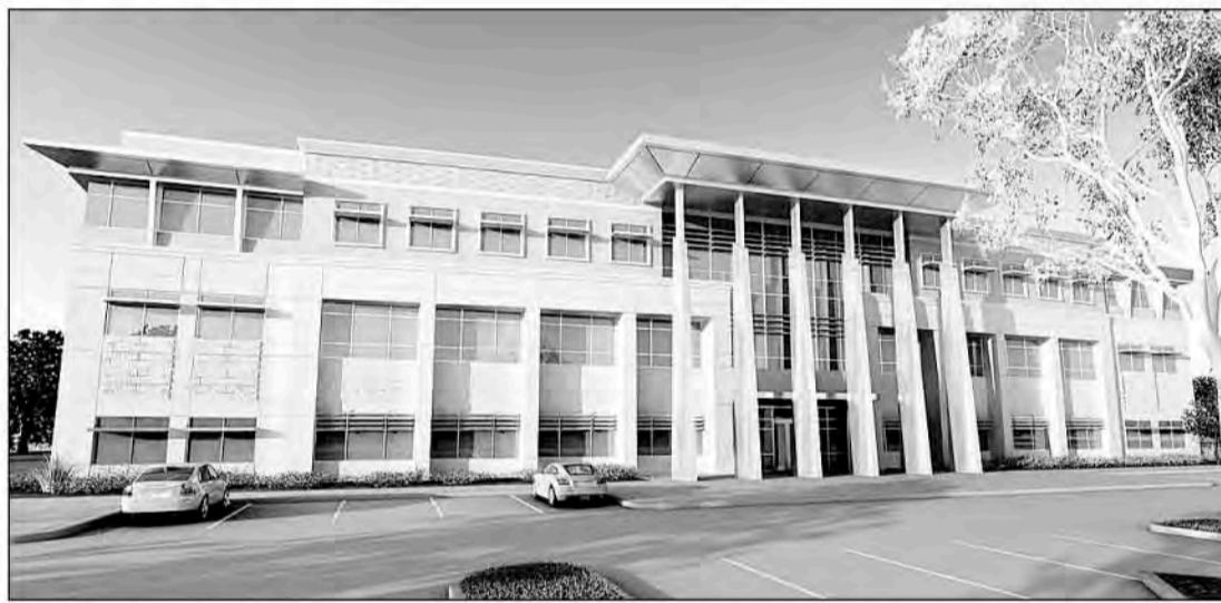
ECO-FRIENDLY: PGAL's new headquarters in Westchase will be built with recycled steel and concrete. PGAL